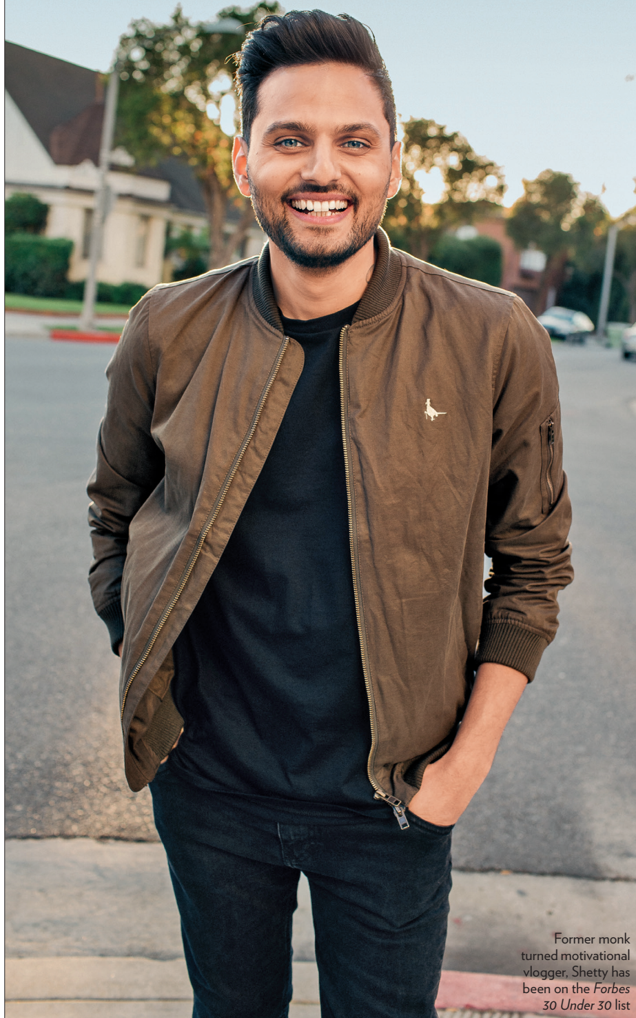
Former monk turned motivational vlogger, Shetty has been on the Forbes 30 Under 30 list