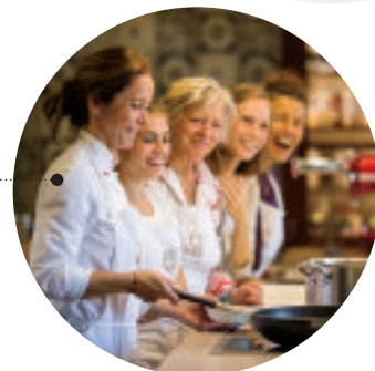
TOP LEFT: STEFANO SCATÀ; TOP RIGHT: CREATIVEPHOTOTEAM/ALAMY STOCK PHOTO; BOTTOM LEFT: COURTESY OF COMO HOTELS; CENTER RIGHT: COURTESY OF GUCCI OSTERIA; BOTTOM RIGHT: ALESSANDRO MOGGI