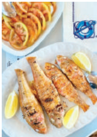
dilig/Adobe Stock (dolphins); Fabrice Demoulin (José Maria da Fonseca); courtesy of Hotel Casa Palmela (bedroom); courtesy of Azulejos de Azeitão (tiles); courtesy of Restaurante Farol (fish)