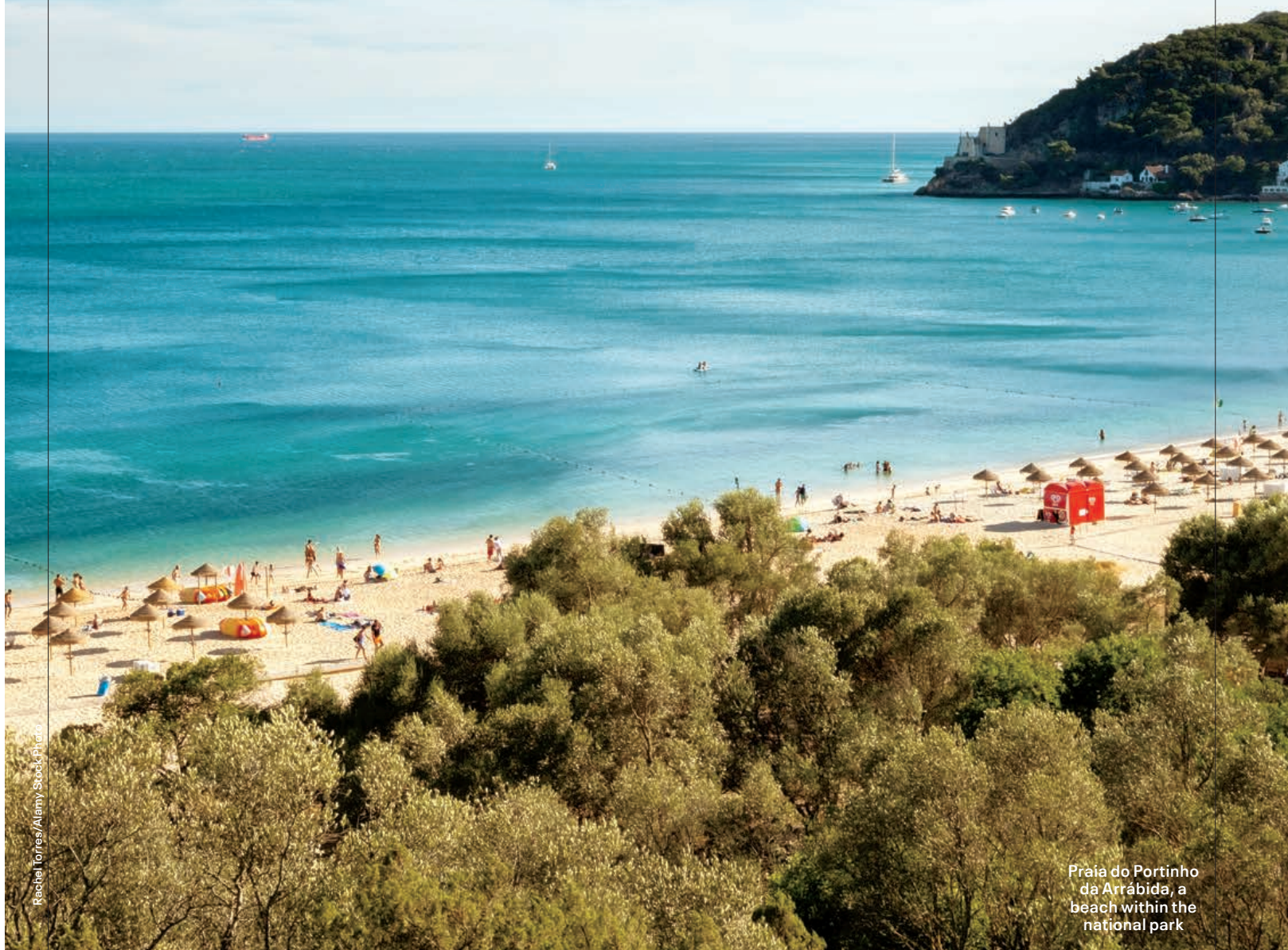
Praia do Portinho da Arrábida, a beach within the national park

the 18th century, after their ancestors fled the Emerald Isle, and it's rumored that Jackie Kennedy and her children decamped to a friend's manor here after JFK's assassination. Arrábida, though, doesn't put on airs. Between the seafood, the wine, the landscape, and the slow pace, life here is good.